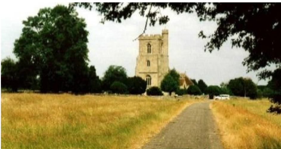
St Owen's Church

Come off the M1 at Junction 13 and take the A421 to Bedford. It takes about 15 minutes. See map below.